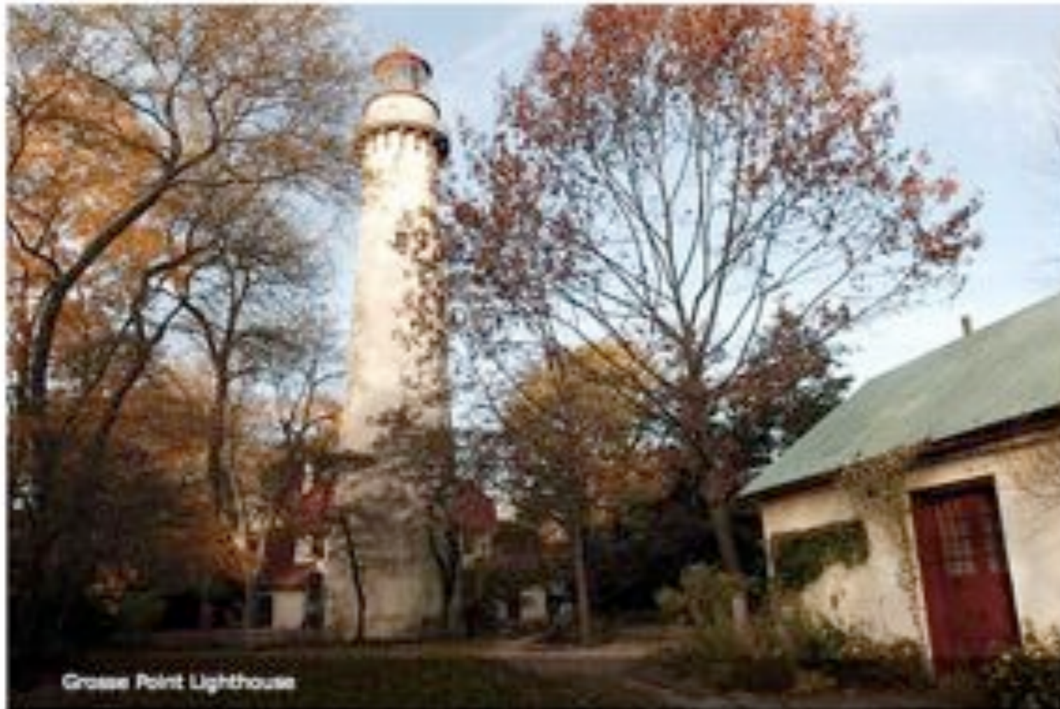
Gross Point Lighthouse