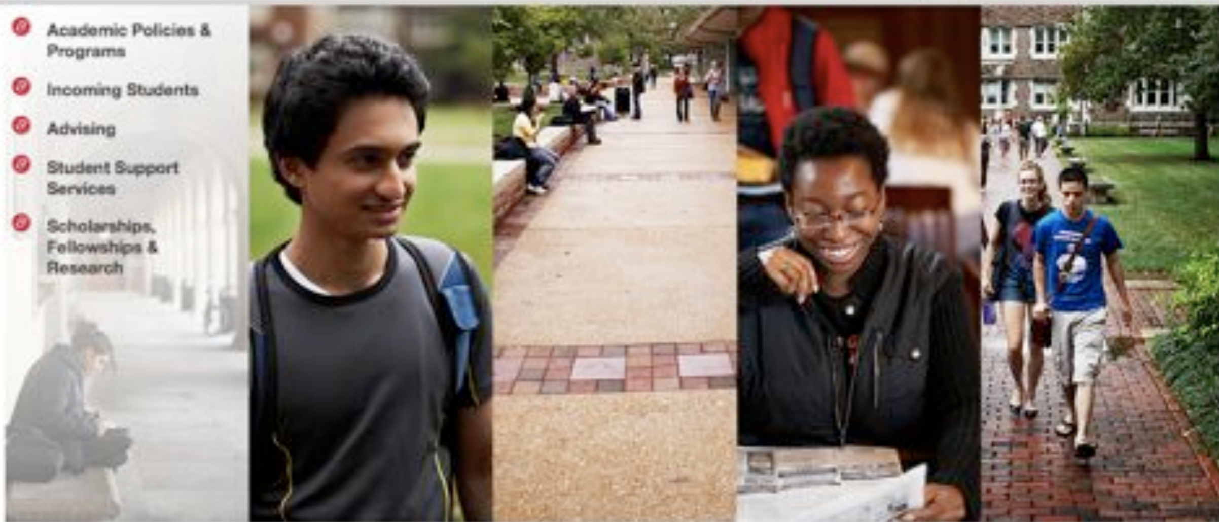
Arts & Sciences at Washington University in St. Louis